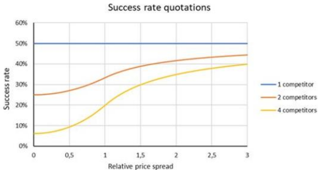
Figure 1: Impact on the success rate of quotations of the relative price spread and the number of competitors (calculated with a uniform distribution of prices)

The figure also shows the impact of the number of competitors of company A. If the customer only requests a quotation from two companies, the success rate is always 50% and no longer depends on the relative price spread. The more quotations a customer would request, the greater the decrease in the success rate becomes when refining the price calculation. For example, if company A faces 4 competitors for an offer, the success rate decreases from 20% (= one in five) to 6.25% (= 50\% \times 50\% \times 50\% \times 50\% ). Note that in our context, the number of competitors for company A is determined by the number of quotes the customer requests, not by the total number of competitors of company A in the market.