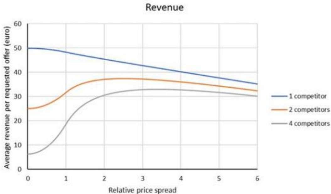
Figure 2: Impact on the average revenue per quotation as a function of the relative price spread and the number of competitors (calculated for an average price of 100 euro and a uniform price spread of +/- 10%)

The calculations and the figure 2 provide us with the following insights: