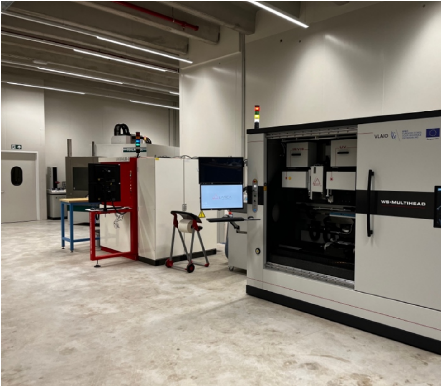
Sirris laser lab