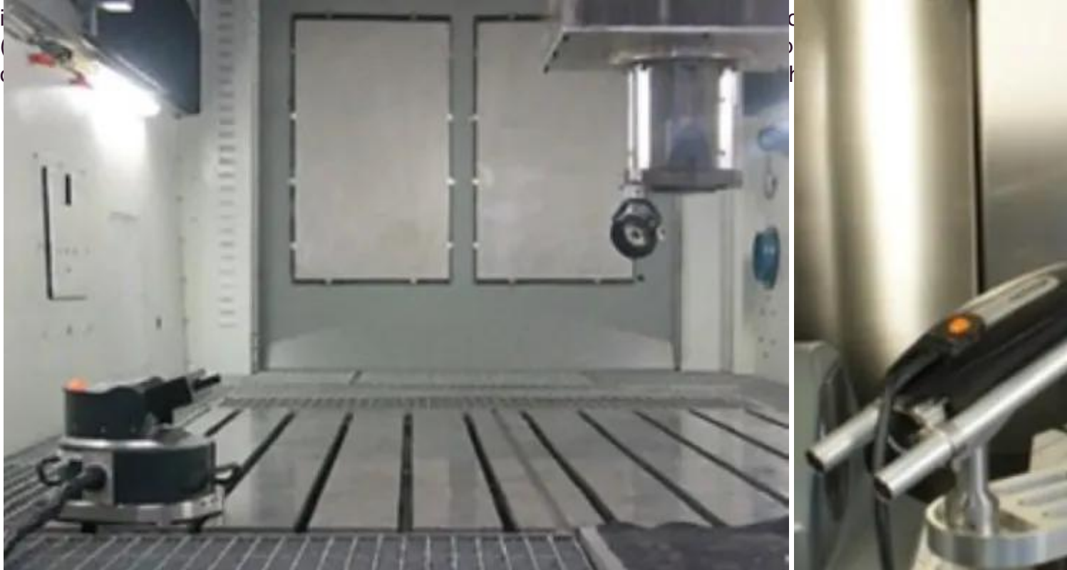
Fig. 1a: Laser tracer (Standard); Fig. 1b: Laser tracer-MT (Standard)

This system uses a self-tracking laser interferometer and a reflector. The laser beam of the laser