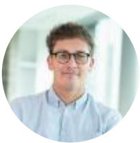
Pieter Jan Jordaens