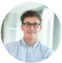
Pieter Jan Jordaens