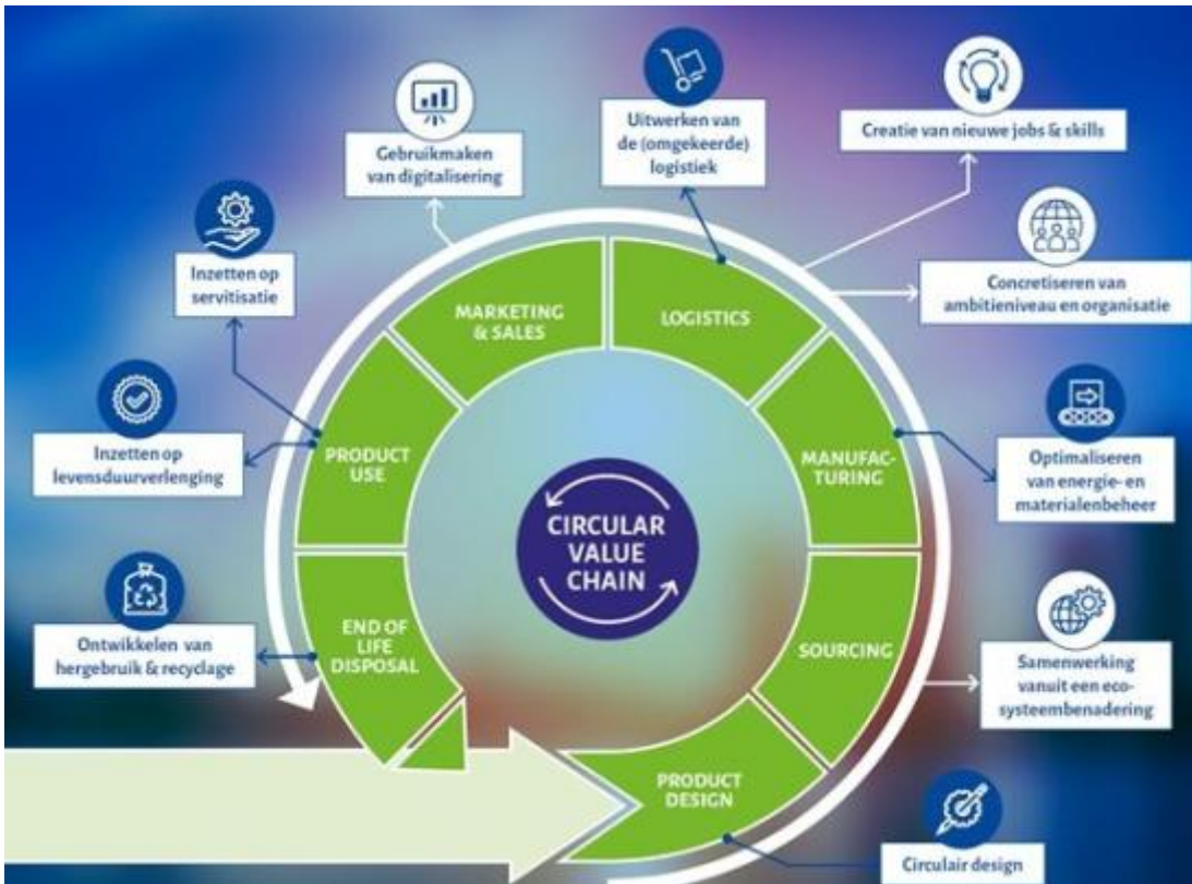
Ten action domains from the white paper 'Circular economy: how to start as a company' by Agoria and Sirris