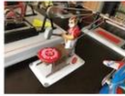
Virunator in our fight against COVID19