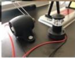
Single dynamo + lamp