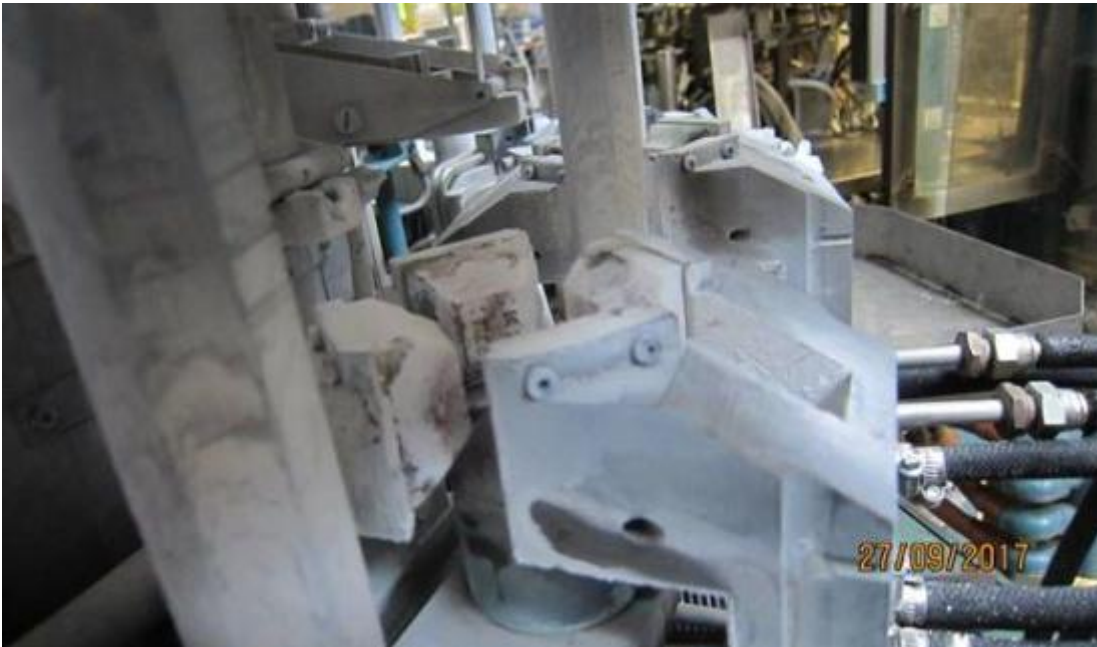
Old burner on the machine with a great deal of quartz deposit