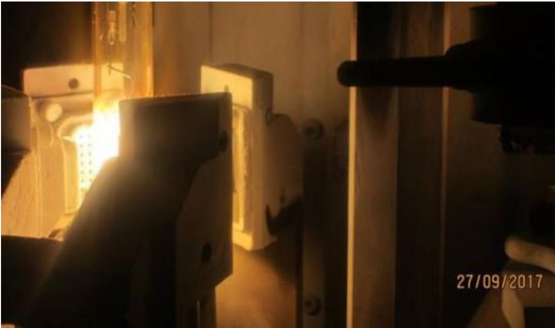
The new burners in action